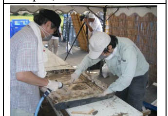
Emergency measure in progress for work of fine art