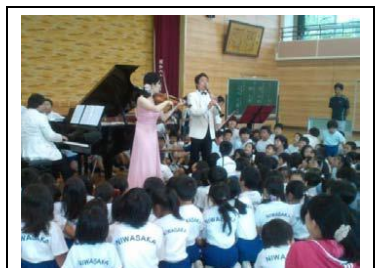
Elementary school students listening intently to music played on piano, violin and clarinet (in Fukushima City, Fukushima Prefecture)

(Result for fiscal 2012: 344 dispatch cases, with cumulative total of dispatch cases after Great Earthquake totaling 803)