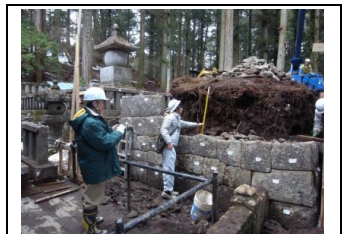
Restoration work for Jigendo Pagoda at Nikko Rinnoji Temple

○The Agency for Cultural Affairs set aside 1.9 billion yen in the fiscal 2012 budget, in addition to a total of 3.2