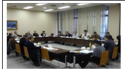
Liaison Meeting for Reconstruction Promoters (in Iwate Prefecture)

○The Agency for Cultural Affairs set up the Arts and Culture Consortium for Reconstruction (secretariat: the Association of Public Theaters and Halls in Japan), a scheme that enables parties such as administrative agencies, artists, art organizations, cultural facilities, companies and aid-giving foundations, to cooperate with one another across fields in May 2012 for supporting the reconstruction of affected areas through culture and arts. The Consortium took measures such as the development of human and organizational networks, collection of information and studies for promoting the reconstruction through culture and arts.