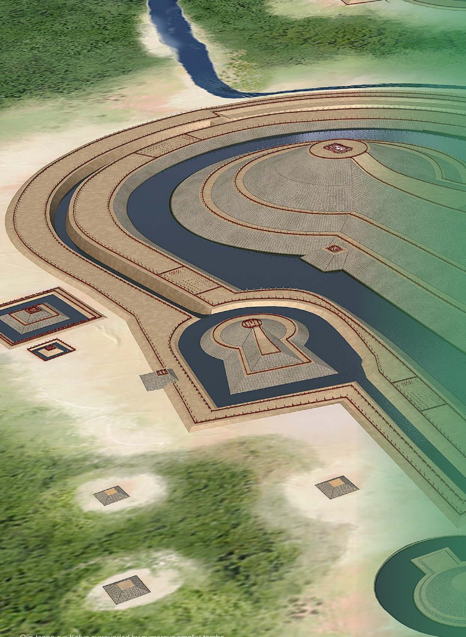
Ojin-tenno-ryo Kofun surrounded by numerous smaller tombs A virtual reconstruction (seen from the west)