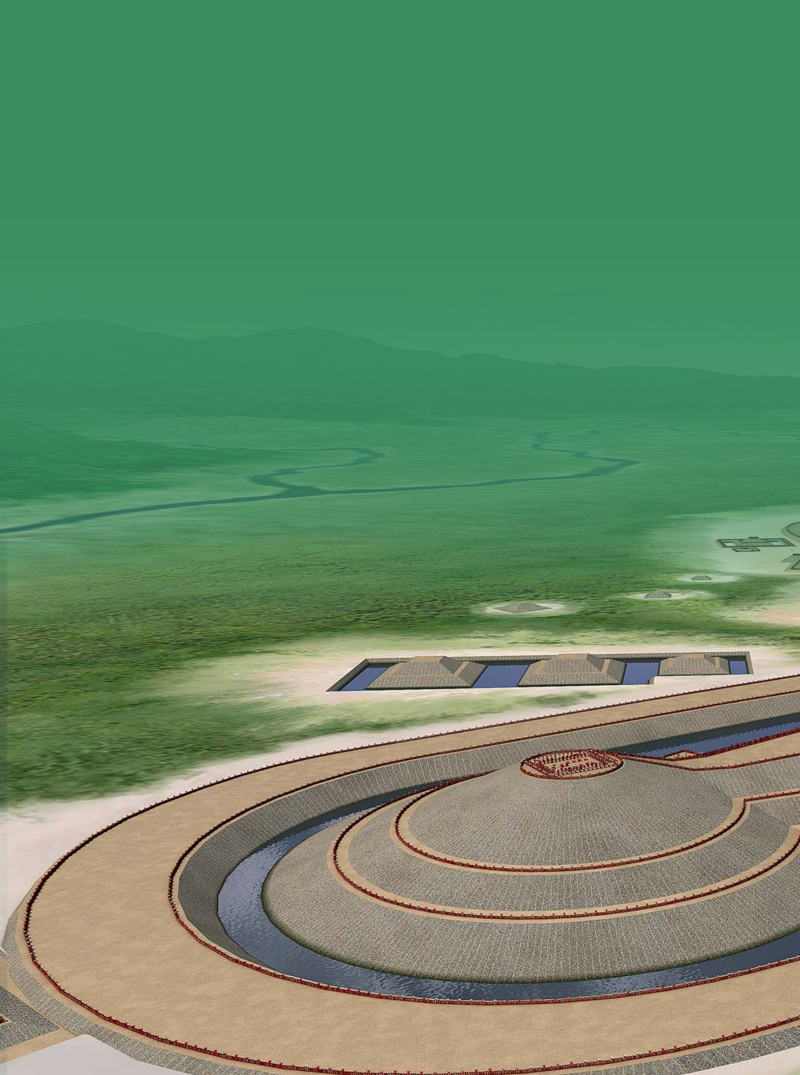
A virtual reconstruction of the Mozu-Furuichi Kofun Group during the Kofun period