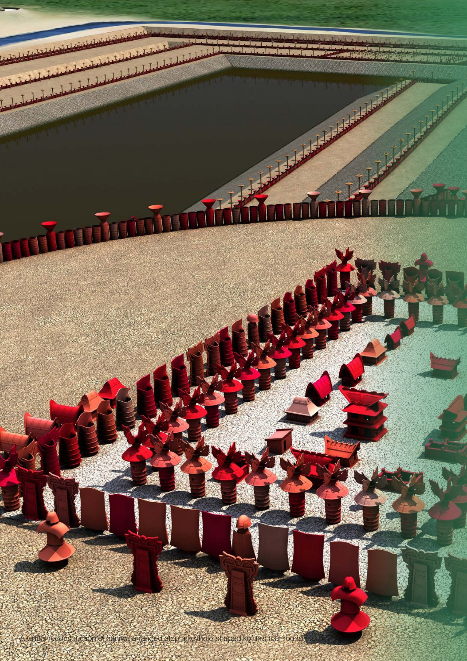
A virtual reconstruction of haniwa arranged atop a keyhole-shaped kofun's rear round mound.