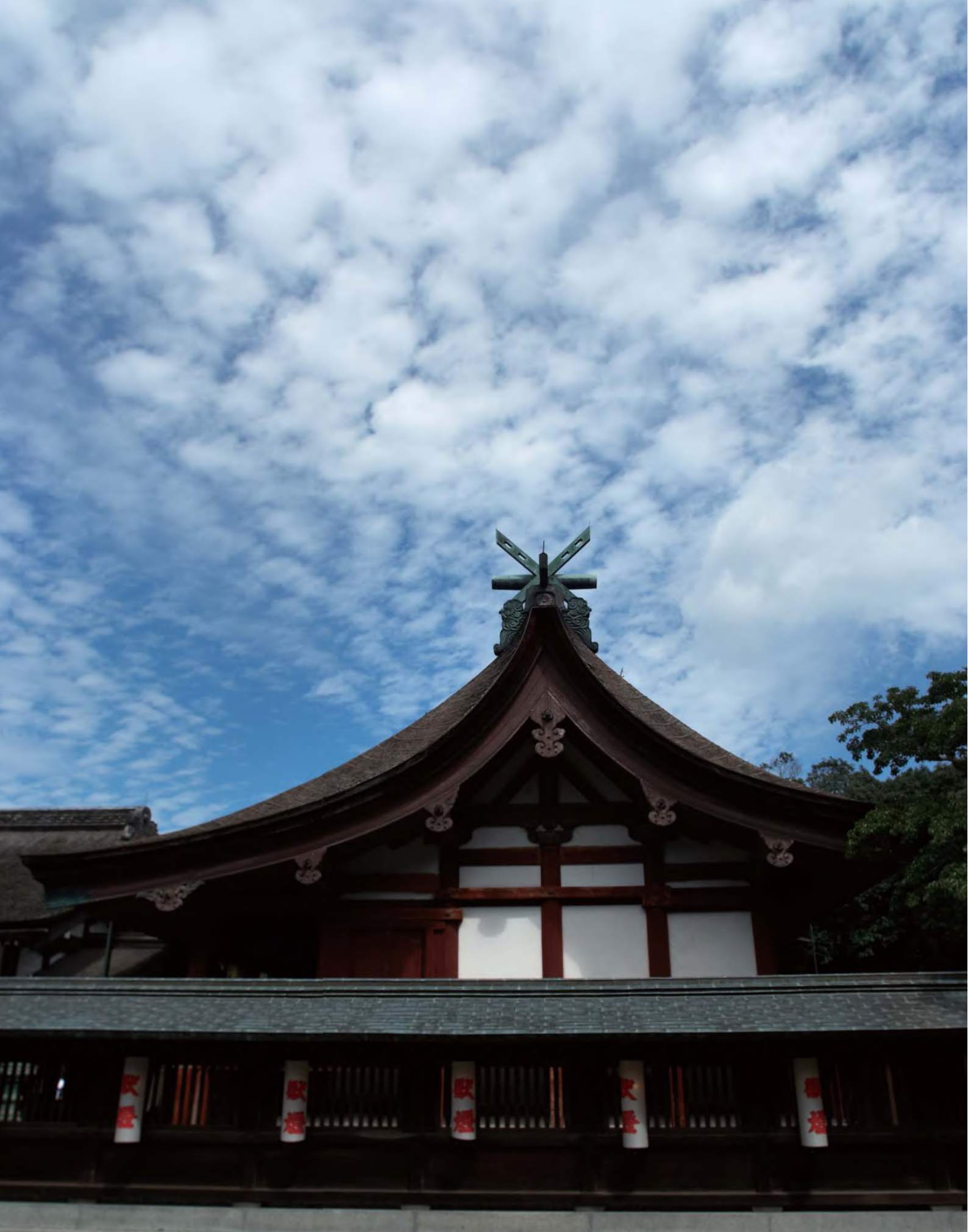
Shrine buildings of Hetsu-miya.