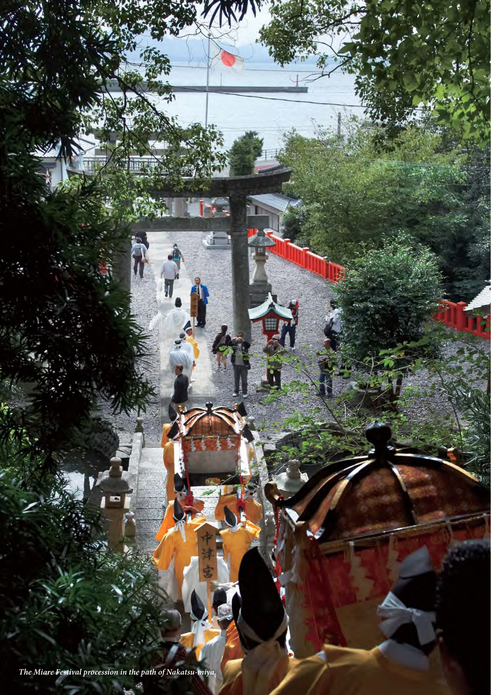
The Miare Festival procession in the path of Nakatsu-miya.