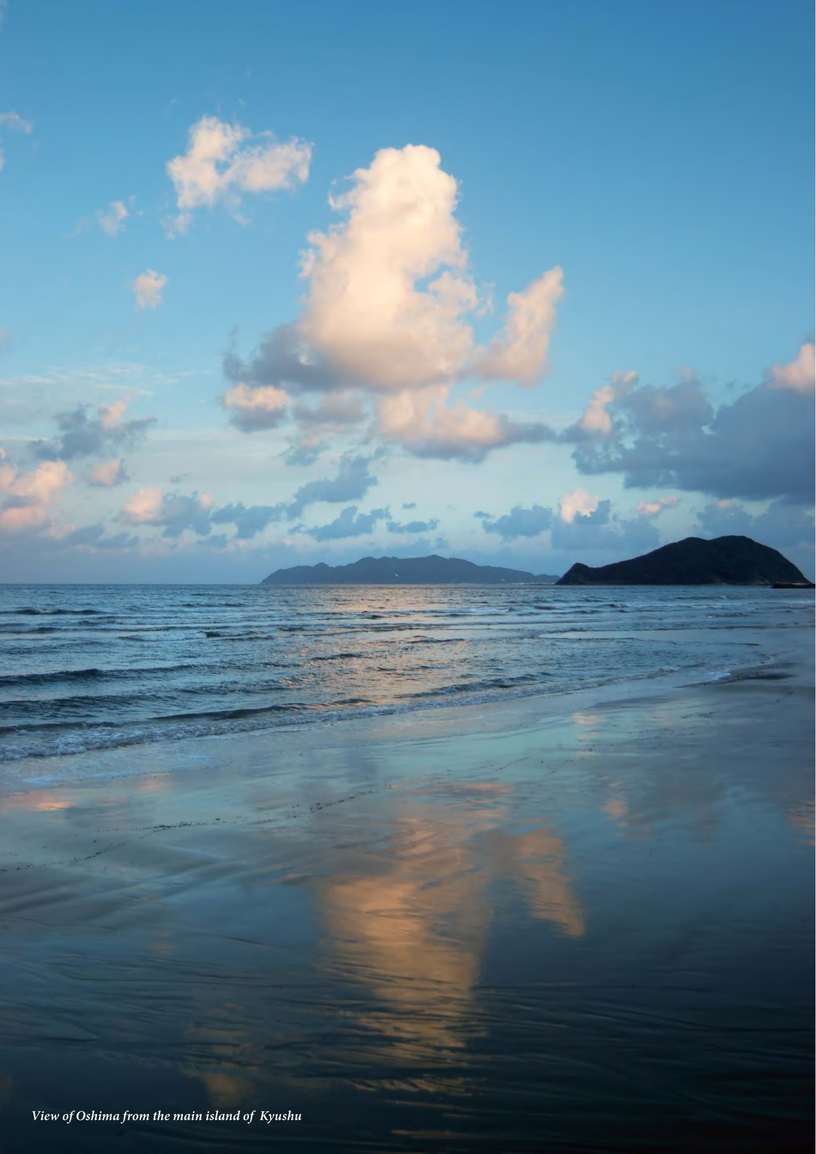
View of Oshima from the main island of Kyushu